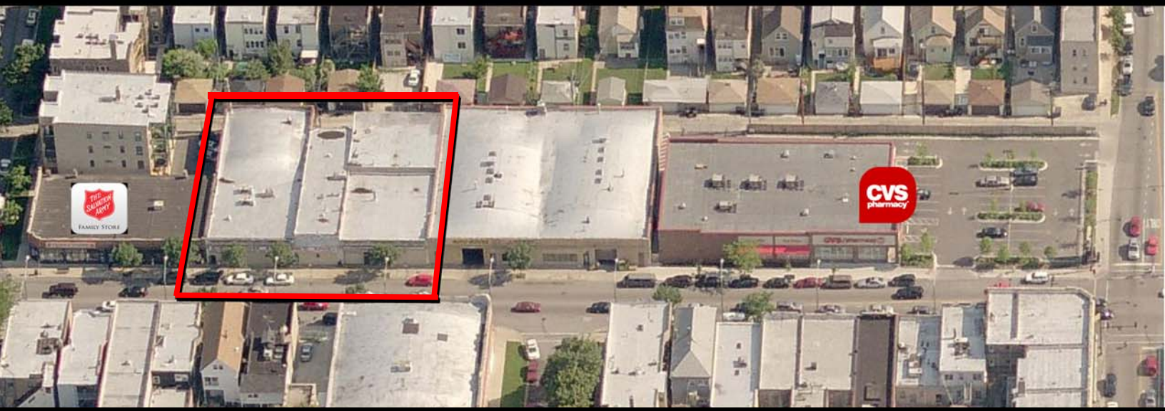
Three Connected Buildings • 3311-17 W. Montrose Ave., Chicago, Illinois